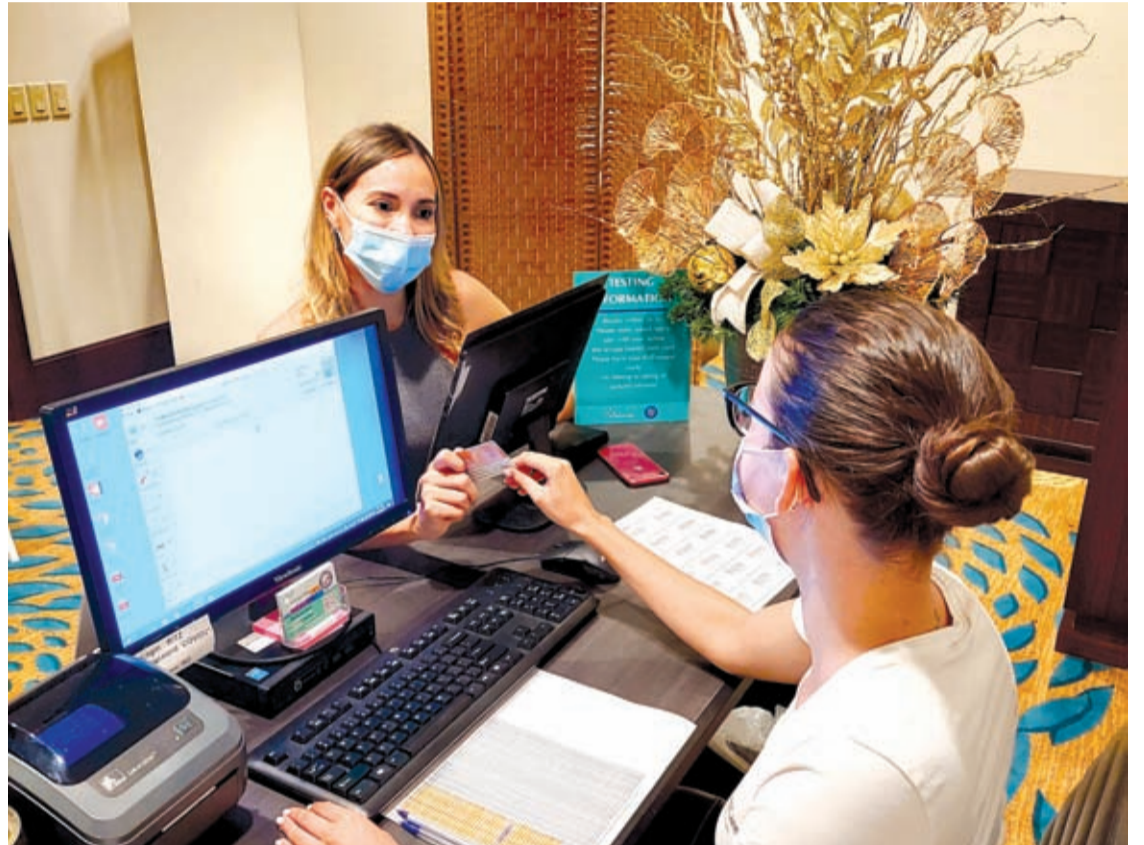
COVID-19 testing to all. Laboratorio di Servizio is ISO-15189:2012

MedCare Clinic, a high-quality medical clinic that specializes in urgent care for tourists and that has been appointed as the national COVID-19 clinic for tourists, and Laboratorio di Servizio, a full-service modern medical laboratory with state-of-the-art equipment, have partnered up to provide fast and reliable